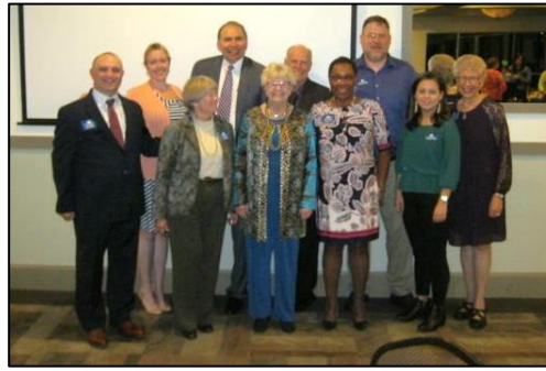
Barbara Roberts with the Board of Directors at the Spotlight on Literacy